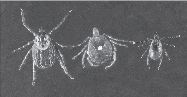
Three species of ticks transmit disease in New Jersey – the blacklegged (deer) tick (right), the lone star tick (center) and American dog tick (left).

For more information, visit the Morris County Division of Mosquito Control website at www.morrismosquito.org and the Centers for Disease Control and Prevention at www.cdc.gov