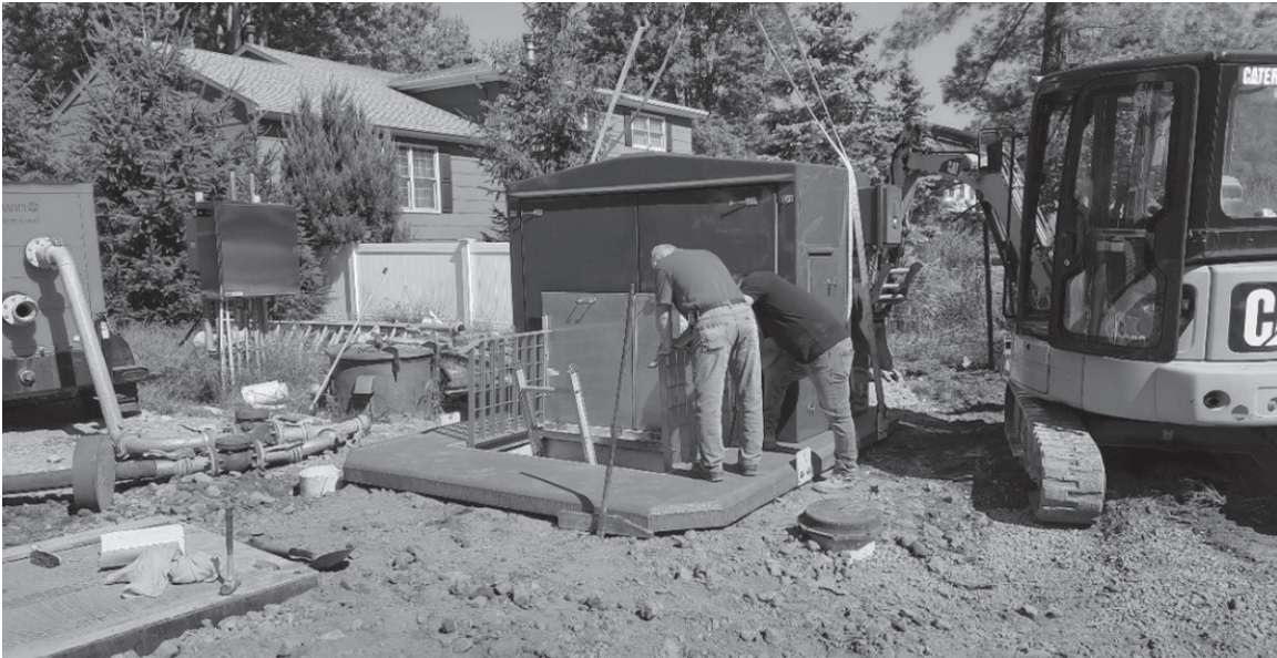
View of new pump station cabinet

Be prepared by taking precautions now. Have your furnace regularly serviced, insulate drafty areas, inspect your plumbing, be familiar with your plumbing system, know where your inside water shut off valve is located and verify that it is working properly. Make sure you have the name and phone number of your plumber handy. Preparing for the cold can keep you from being left in the cold without water this winter.